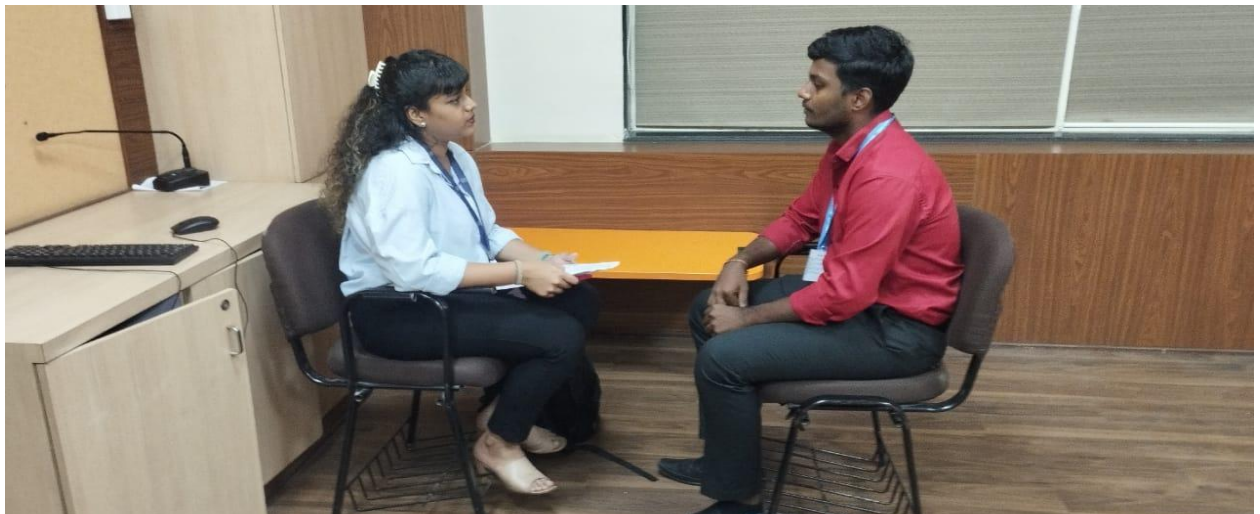
Glimpse of Interview Process