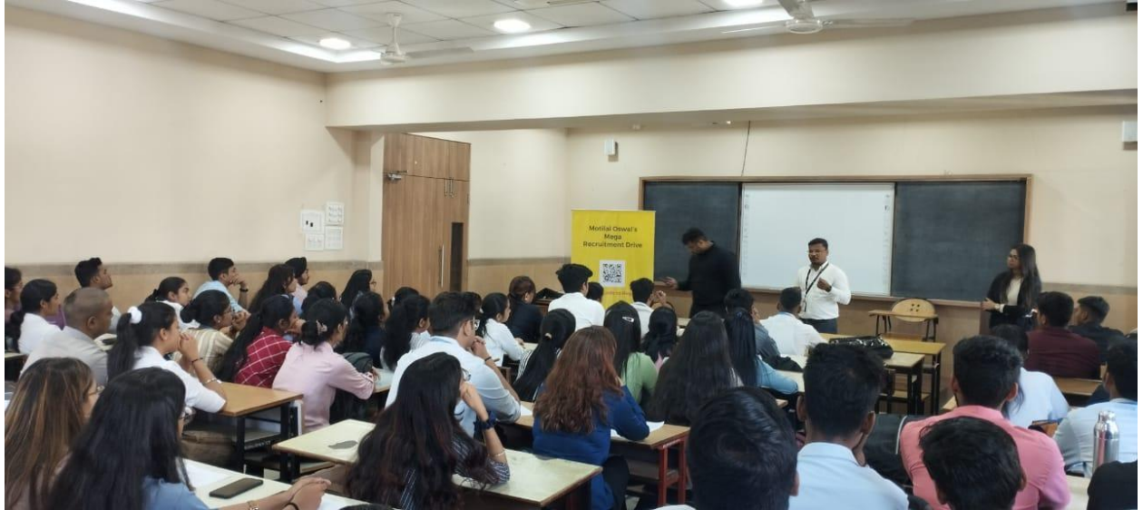
Glimpses of Pre-placement Talk