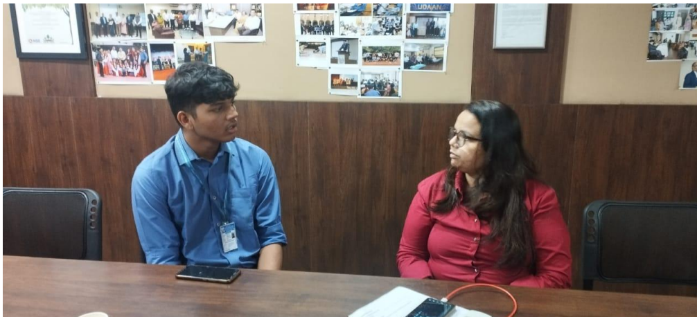
Glimpses of the Interview Process