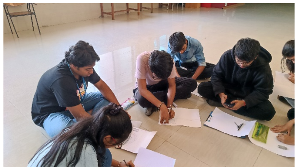
NSS Programme Officer