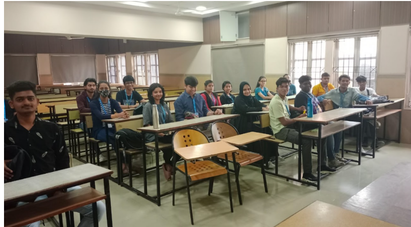
FYBCOM(A) div students attending the session.