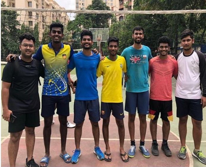
VOLLEYBALL BOYS 1ST PLACE SPORTS WEEK 2019 - 2020