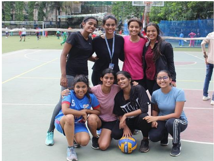
VOLLEYBALL GIRLS 1ST PLACE SPORTS WEEK 2019 - 2020