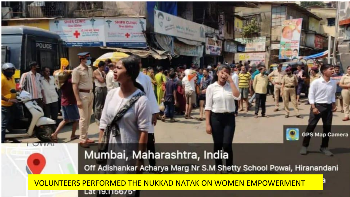
NSS Programme Officer