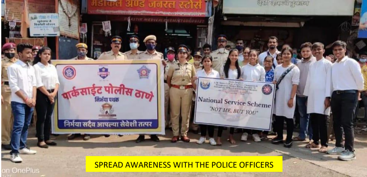
SPREAD AWARENESS WITH THE POLICE OFFICERS