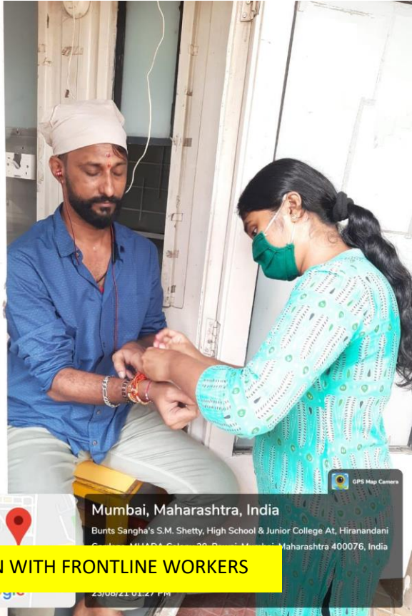
RAKSHABADHAN CELEBRATION WITH FRONTLINE WORKERS