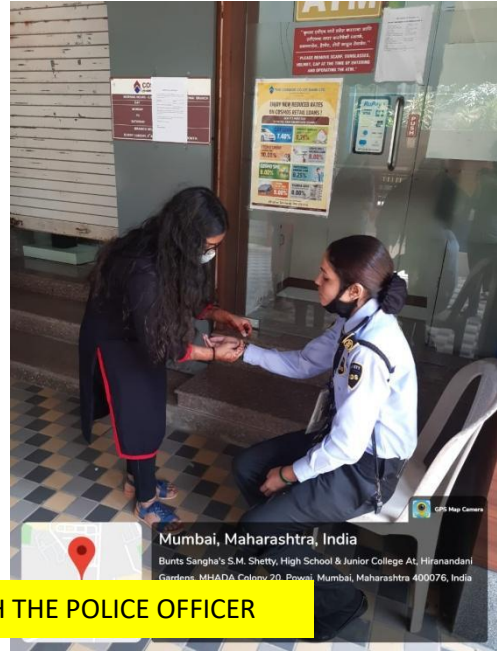
CELEBRATING THE FESTIVAL WITH THE POLICE OFFICER