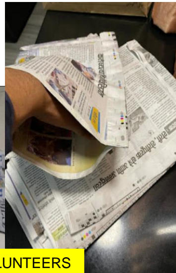
PAPER BAG WAS MADE BY THE VOLUNTEERS