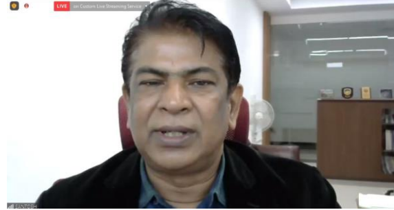
NSS Programme Officer