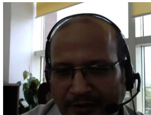
NSS Programme Officer