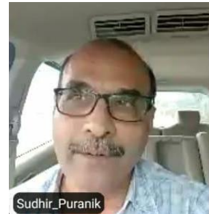
NSS Programme Officer