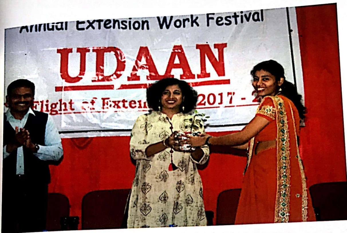
SECURED 3 RD PRIZE IN POSTER COMPETITION